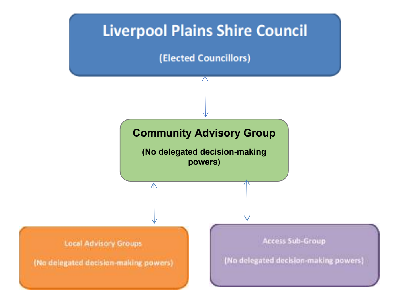
Figure 1: Overview of LAG Structure

The primary function of the Advisory Group is to align with Council's Delivery Program to: